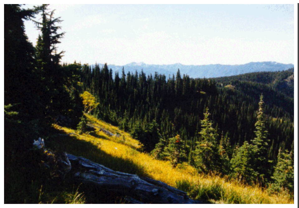
A view from Hurricane Ridge in Olympic National Park. One of our summer stops.