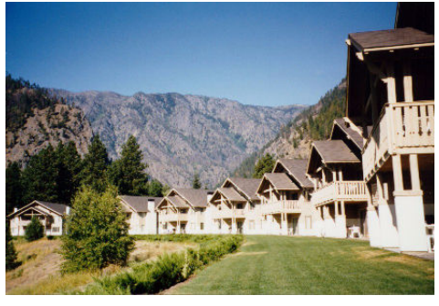
The Trendwest Condos in Leavenworth.

It was good to have the folks visit again. This year they managed to bring the