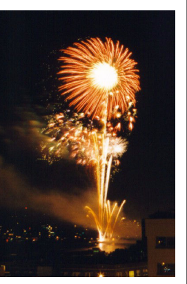
Fireworks can produce interesting effects.

planted ourselves. Unfortunately "mom's" friends who owned the place decided the construction was too poor to deal with and sold it. Kelly is now living in an apartment north of Seattle, convenient to buses and shopping, as well as her bowling. She